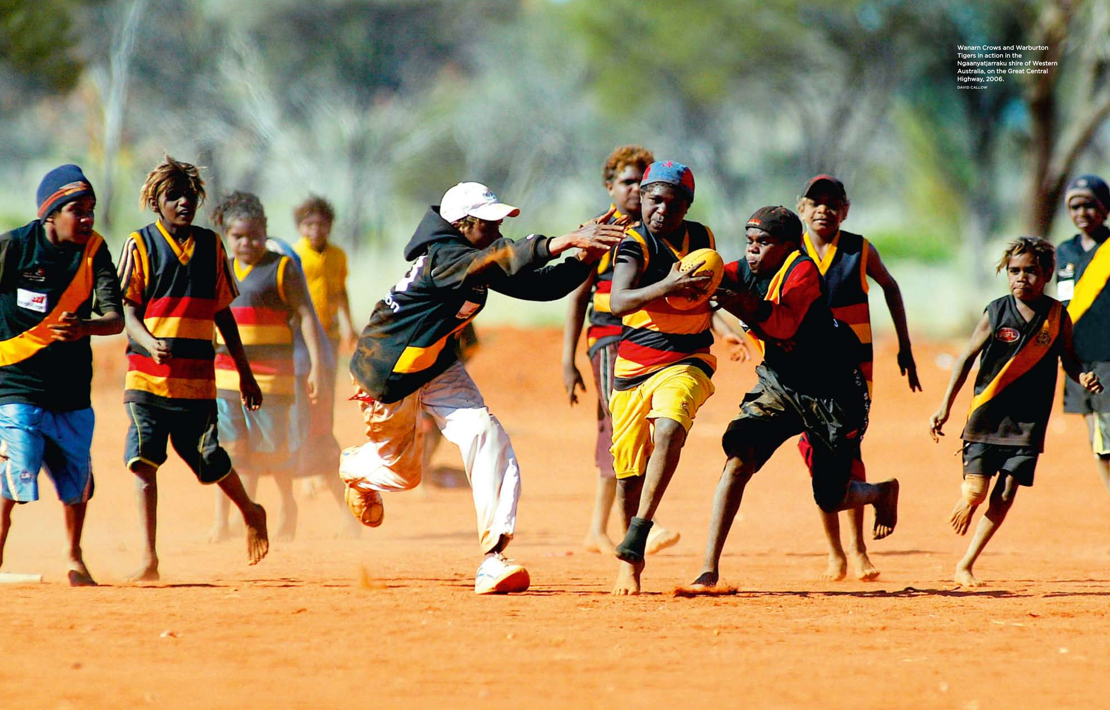
Wanarn Crows and Warburton Tigers in action in the Ngaanyatjarraku shire of Western Australia, on the Great Central Highway, 2006.