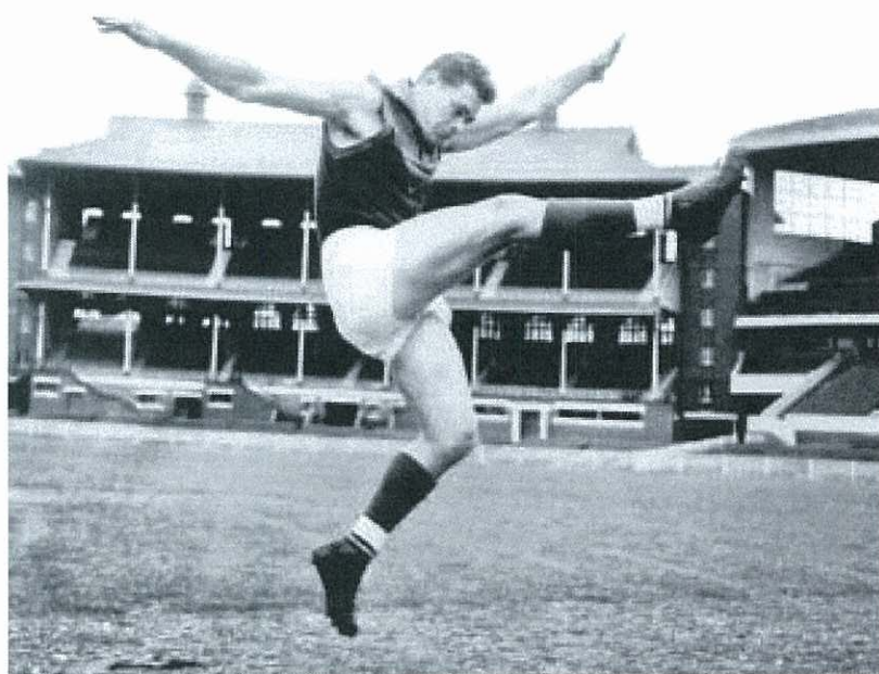
Ron Barassi's distinctive kicking style, as seen at the MCG in 1959.

For credit card orders call 1300 306 107 or order online at www.heraldsun.com.au/shop . For mail order, post a cheque/money order to: Herald Sun Shop, PO Box 14730, Melbourne, VIC, 8001.