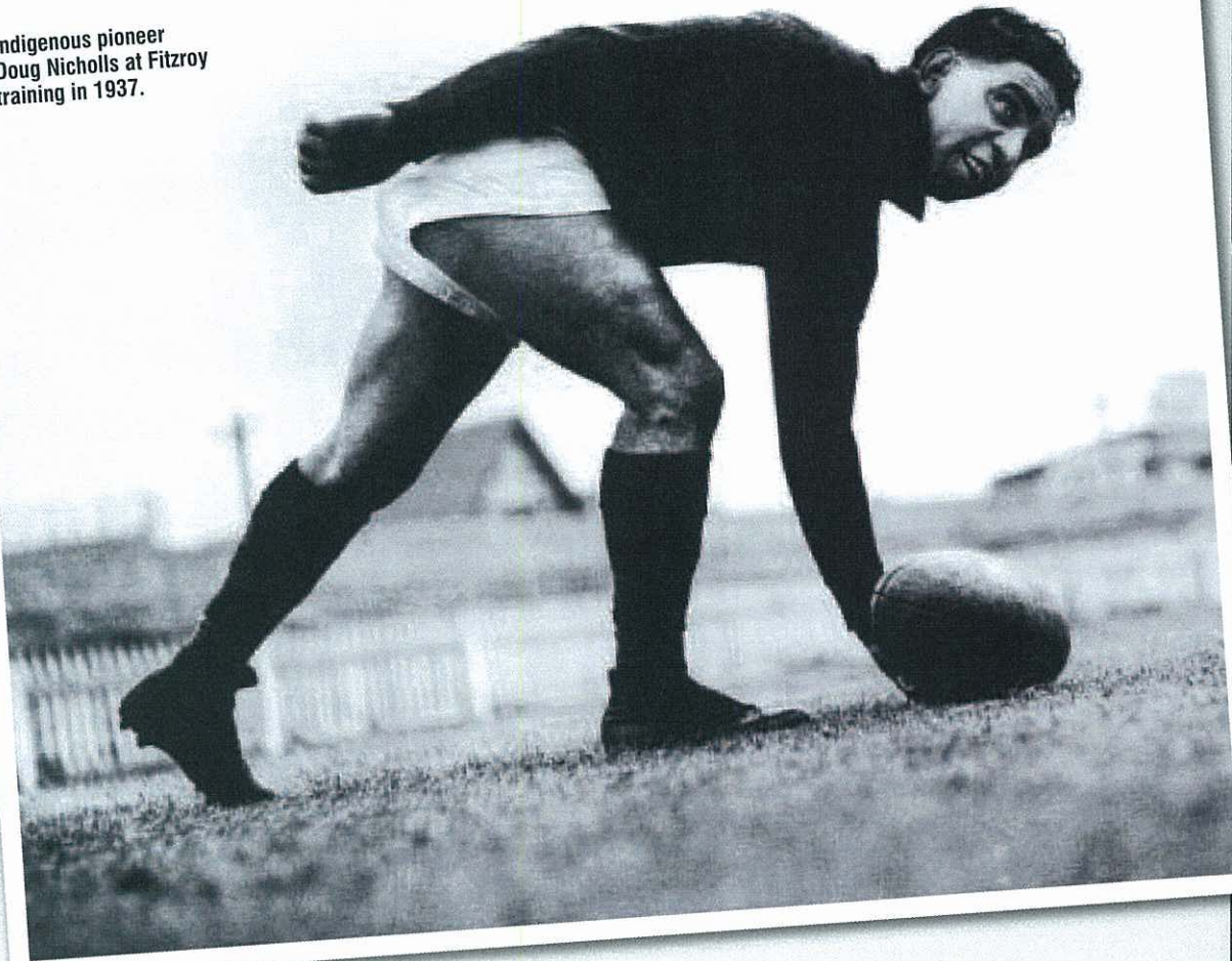
Indigenous pioneer Doug Nicholls at Fitzroy training in 1937.