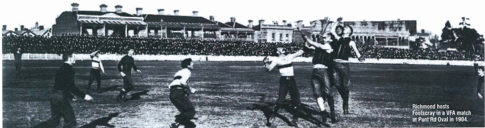
Richmond hosts Footscray in a VFA match at Punt Rd Oval in 1904.