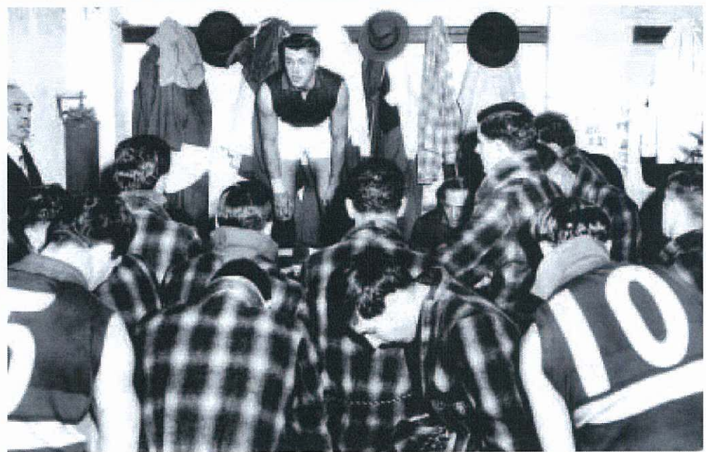
"Mr Football", Ted Whitten, addresses the Footscray players before a match against St Kilda at the Junction Oval in 1957.